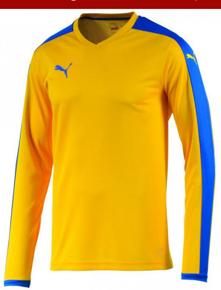
team yellow-puma royal

Material: 100% Polyester microfibre; Double knit: Pique; 130 g/m²; Pre-heat setting, Bio-based Wicking Finish. Details: The Shirts of legends! Used by the games greatest, worn by you. PUMA Cat brandings to righthand chest and sleeves. PUMA Form Stripe insert sleeve panels. 1x1 Rib sleeve cuffs for fit and comfort. Mesh back panel from comfort and temperature control. Crew Neck. 1x1 Rib cuffs for fit and comfort. Double Knit Polyester Pique fabric. Clean, classic and distinctly Football.