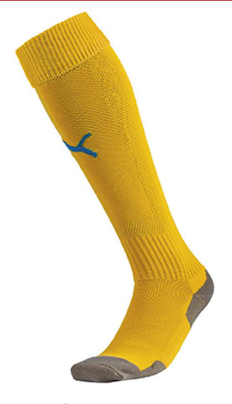
team yellow-puma royal

73% polyester 15% cotton 12% elastane Puma Cat branding, knitted sock to front, contrast colour welt, knitted mesh for breathability cotton heel and toe for comfort ankle brace for stability.