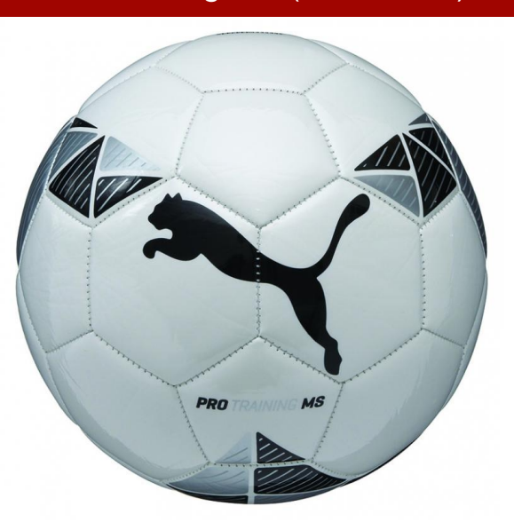
ball white-black-metallic silver

Material: TPU Profile: Entry level traning ball. Suitable for both training and fun games with friends. The combination of the TPU casing with rubber bladder and machine stitching gives the ball a soft feel; excellent shape; bounce and flight characteristics.