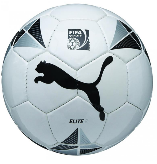
ball white-black-metallic silver

Material: PU Profile: High quality hand stitched match ball for all conditions. Constructed from 32 panels with equal surface areas for reduced seam stress and near perfect round shape. The PU outer provide's a soft touch and high abrasion resistence. Panels are strengthened with multilayered polyester; viscose and blended backing for enhanced stability. The seams allow an even flow of air for a perfect aerodynamic performance. Six wing latex bladder for superior touch and PUMA AIR LOCK valve for air retention. FIFA Inspected logo guarantess the highest level of performance and excellent size and shape retention , game after game. Packaging: Polybag with inflation needle.